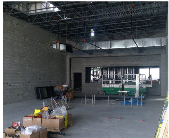
Future Fabrication Lab