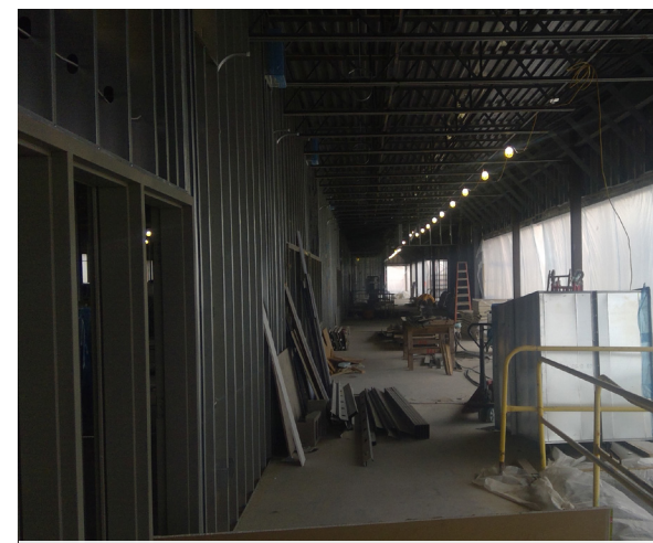
Wall Framing at Second Floor Corridor