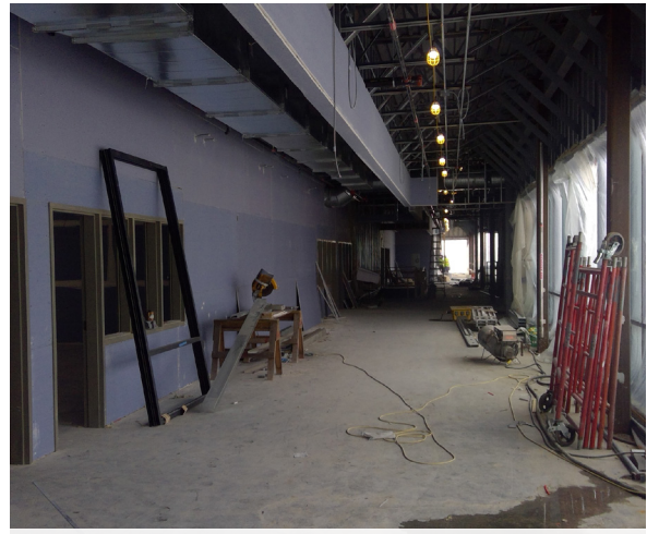
Drywall Installation in Second Floor Corridor