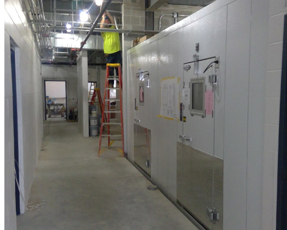
Equipment Installation in the Kitchen