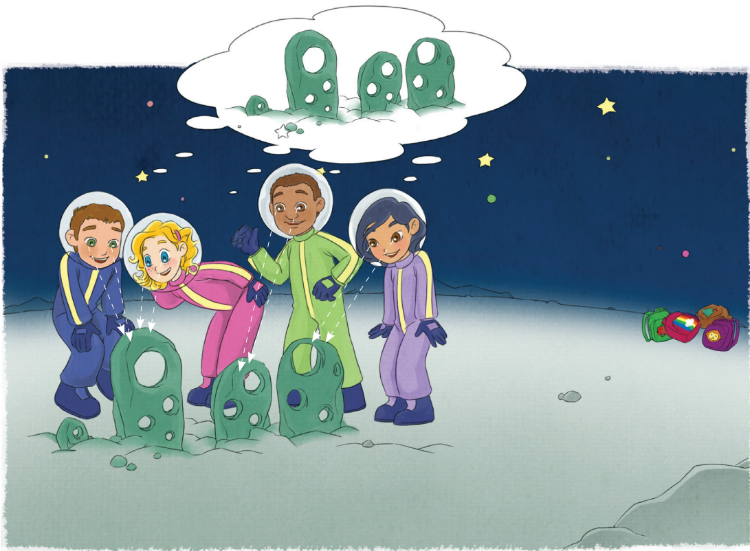
Here, the kids are looking at space rocks and thinking about space rocks!

Activity 5 When you are reading books with your children, find opportunities to trace eye gaze and talk about what the character is looking at and thinking about. See the attached illustration from the book as an example.